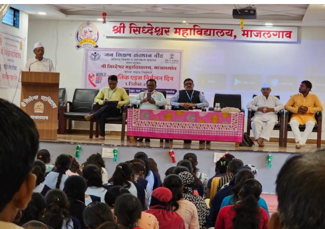
World AIDS awareness Day Programme