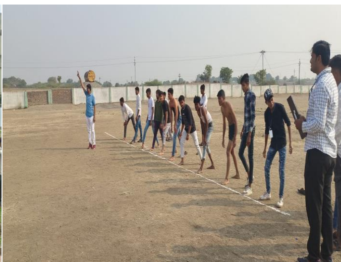
Students participation in College Annul Gathering sports activities