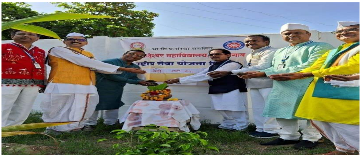
Meri Mati Mera Desh Abhiyan at College Campus