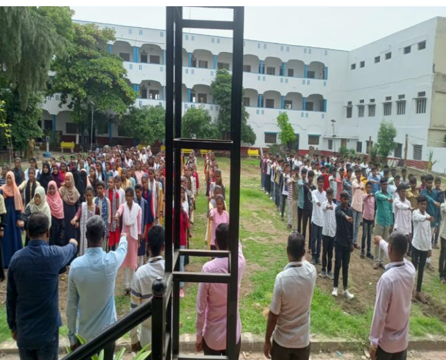
Students taking Oath of Sanvidhan Din