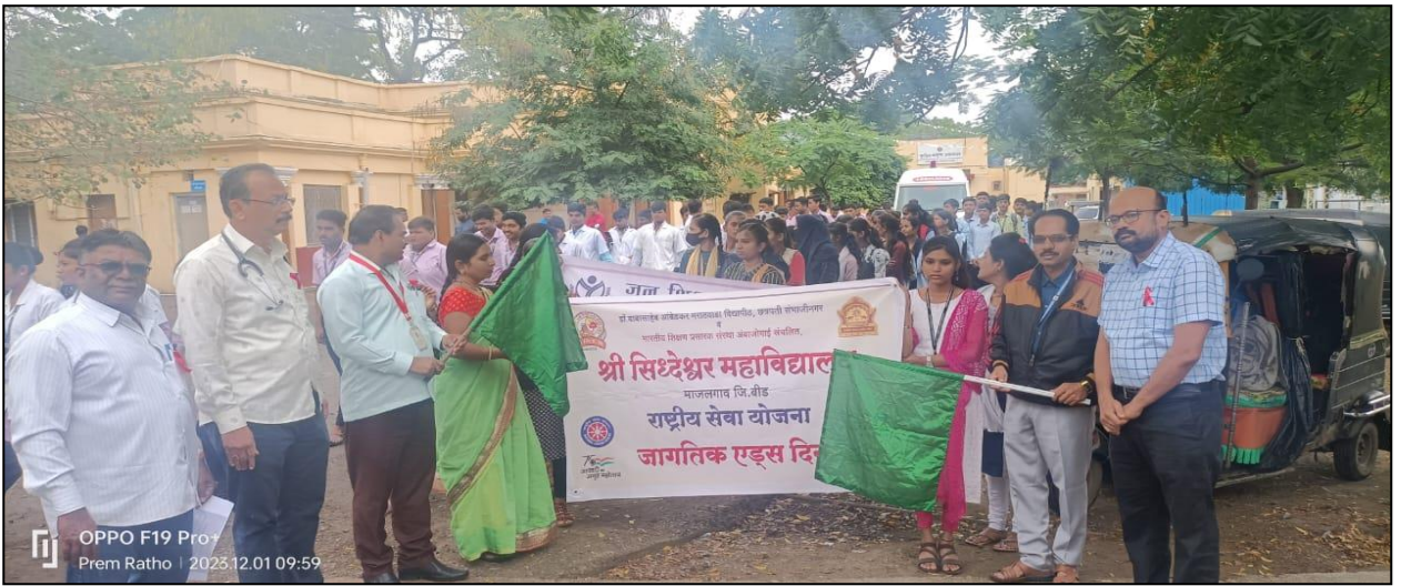
AIDS awareness rally by NSS Dept. in collaboration with.PHC Majalgaon