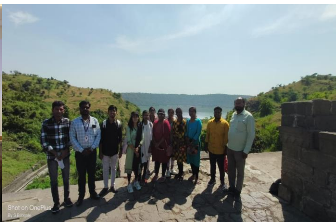
Dept. of Zoology excursion tour at Lonar Dam