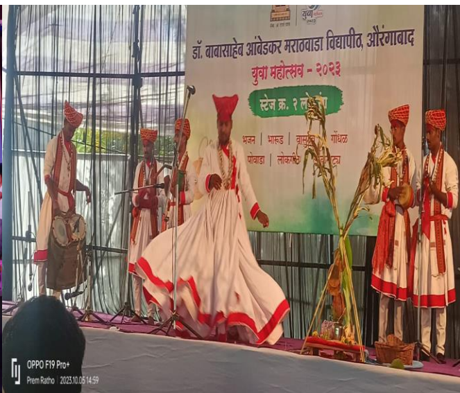
Students Participation in Central Youth Festival at Dr. BAMU, Ch. Sambhajinagar