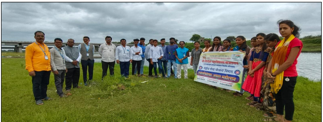
Cleanliness Drive of Sindaphana River conducted by NSS Dept.